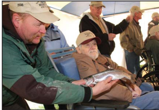
Residents of the Minnesota Veteran's Home enjoyed fishing at the trout pond set up at last year's Fishing Opener.